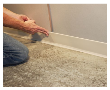
Use only flexible vinyl or rubber molding.

All parts available in 10ft lengths only. Available in anodized aluminum only See website for more details www.panolam.com