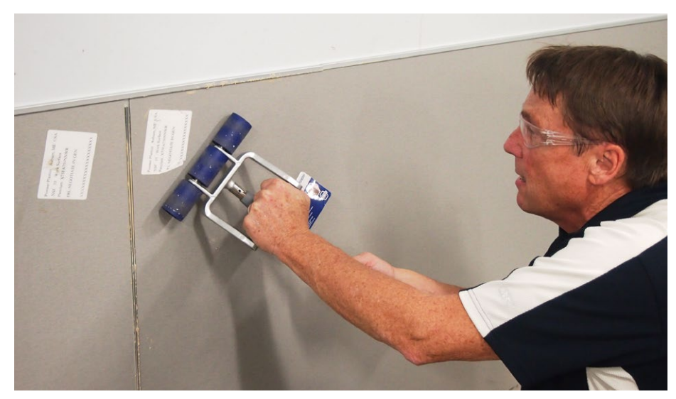
Roll with D-handle laminate roller.