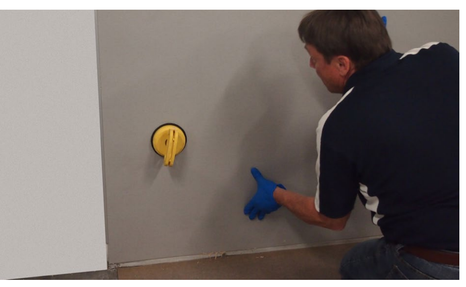
Use suction cup to fix panel.