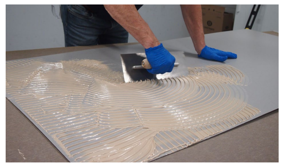
Use crosshatch method close to edge as shown in image above.