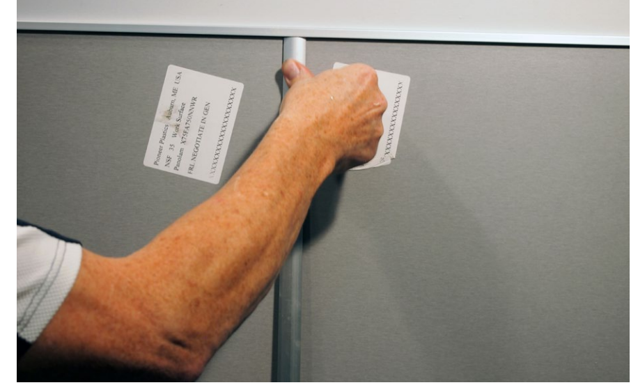
Install division cap.